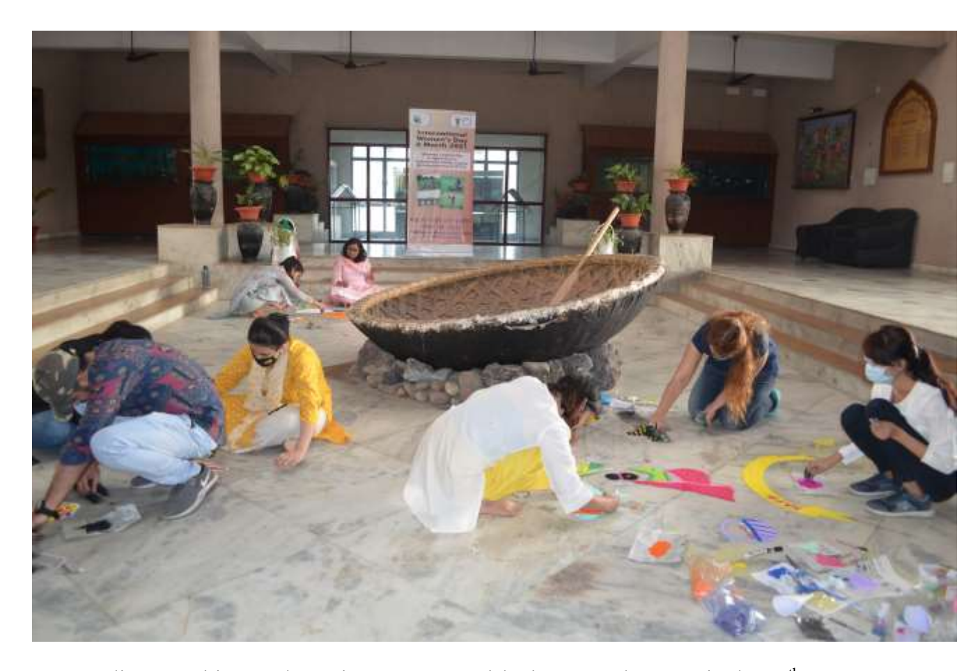
A Rangoli Competition on the topic "Women in Fisheries" was also organised on 8<sup>th</sup> March, 2021 in which staff and students of ICAR-NBFGR actively participated.